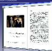
On-screen view of eBook